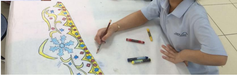
Wall Murals Primary Grades AHISK / OIS